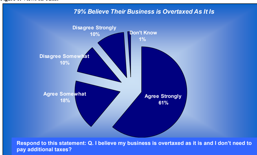
Figure 1: Views on Taxes

Overall, 79% of respondents somewhat or strongly agree their business is overtaxed, and they do not want to pay additional taxes.